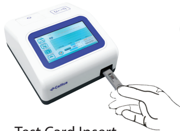
Test Card Insert