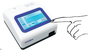
Click "Start" Icon