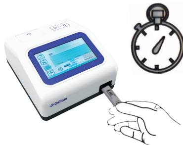
Timing the Reaction Manually