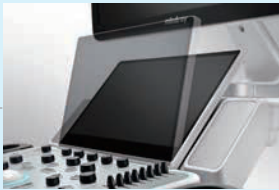
13.3" slim full HD LED touchscreen, 30 degree rotation