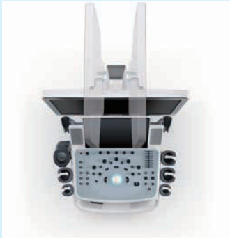
21.5" full HD LED Monitor, 180 degree rotation